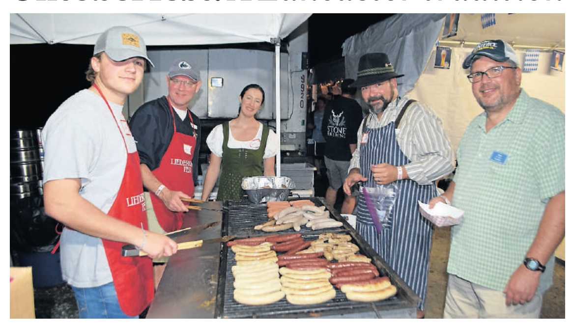
Lancaster Liederkranz's Oktoberfest has German food, including bratwurst, weisswurst (veal), kielbasa and currywurst.

Continued from B6 next to the creek and tents will